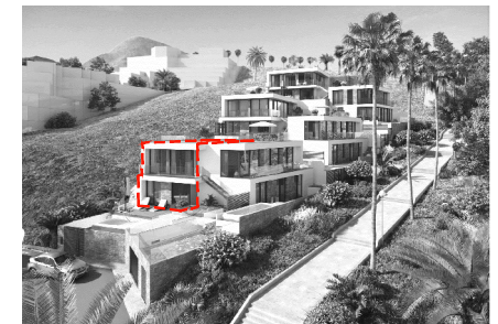
HOUSING ESTATE 3D SCHEME