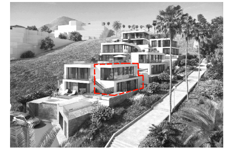
HOUSING ESTATE 3D SCHEME