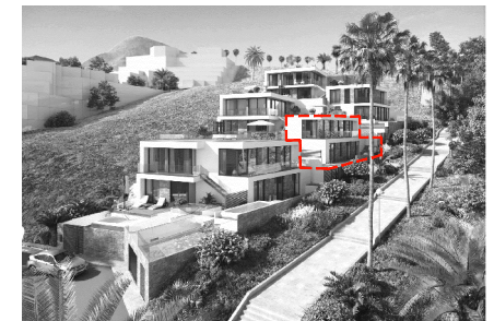
HOUSING ESTATE 3D SCHEME