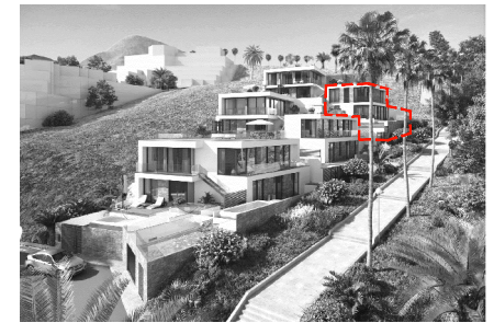
HOUSING ESTATE 3D SCHEME